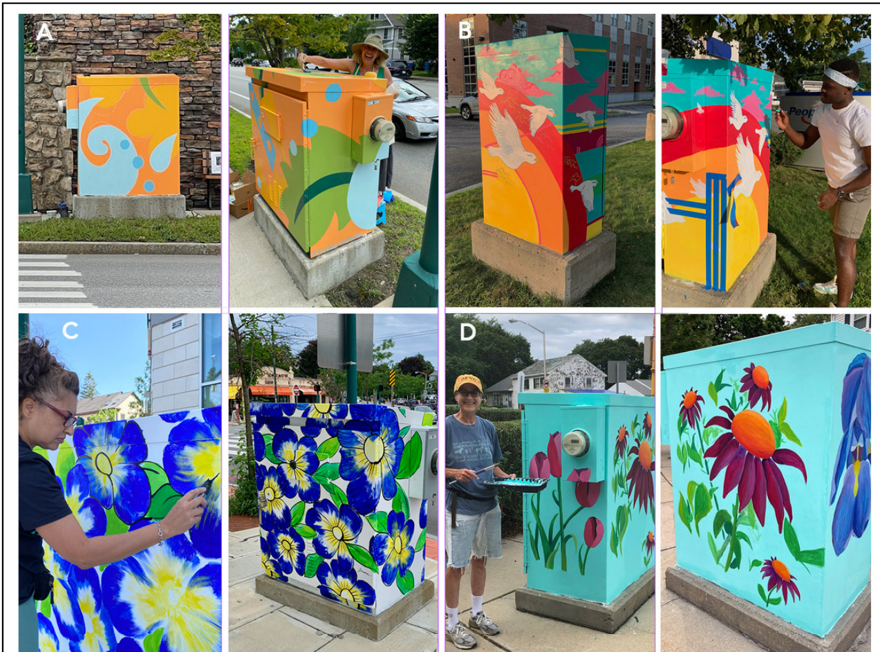
A. Artist Adria Arch Trapelo Road across from the Spray Park

Traffic light control boxes (“Transformer Boxes”) are located at busy intersections and along streets throughout our town. Painting these drab utility boxes brings art out of our homes and studios and into the public; beautifies our environment; adds interest to our commutes and walks; and provides opportunities for members of the community to create. Last year five boxes were painted, four of which are shown below: