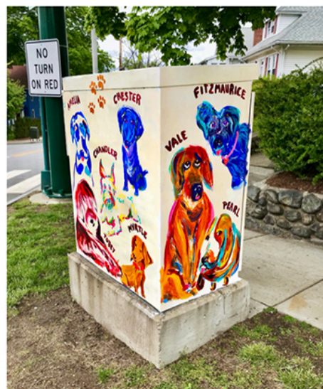
Trapelo Road and Slade Street by Ian Todreas