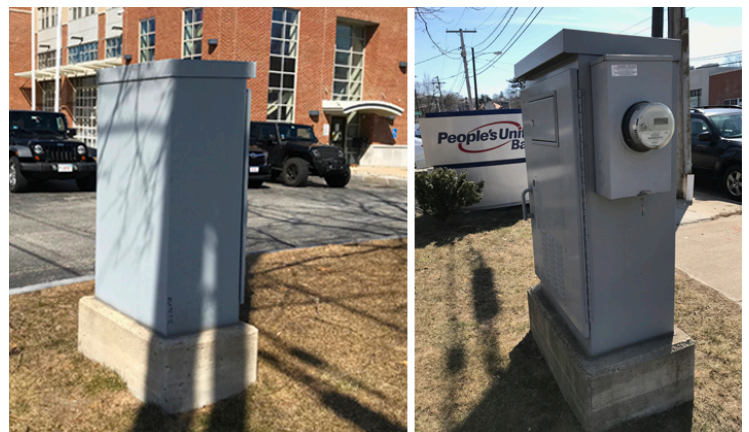
Belmont Fire Station Headquarters on Trapelo Road by People's United Bank