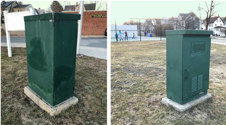
Intersection of Beech and Waverley Streets, near Town Field Playground and Courts, adjacent to the Beach Street Senior Center