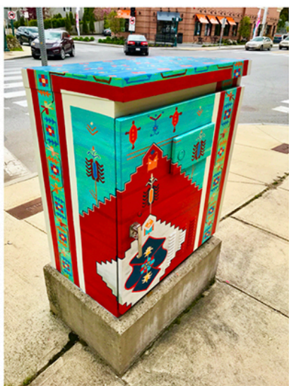
Pleasant and Brighton Streets by Liz LaManche

Traffic light control boxes (“Transformer Boxes”) are located at busy intersections and along streets throughout our town. Painting these drab utility boxes brings art out of our homes and studios and into the public; beautifies our environment; adds interest to our commutes and walks; and provides opportunities for members of the community to create. Last year the town’s first three transformer boxes were painted, shown below: