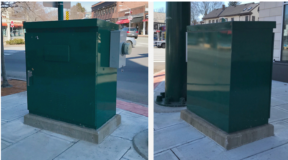
Intersection of Trapelo Road and Common Street in Cushing Square, in front of the new Bradford development