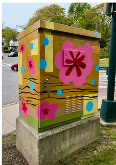
Town Hall at Concord and Pleasant Streets by Liz LaManche